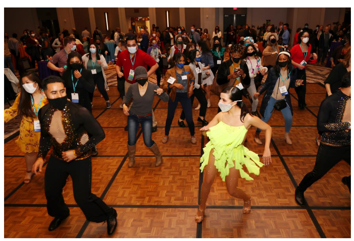
Attendees dance at the APTA Celebration of Diversity on Feb. 3, 2022, in San Antonio, Texas.